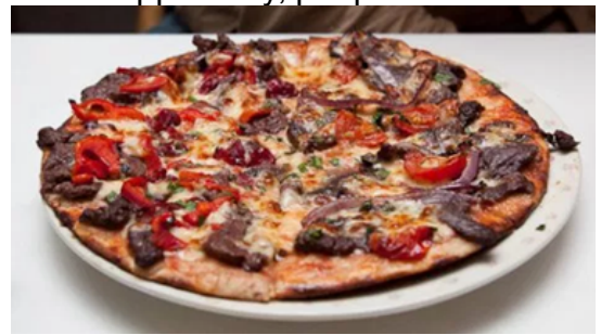
Burgers, Fries, and Chicken Nuggets Pizza: It's a pizza with a McDonalds Happy Meal on it!

Crocodile, Emu, and Kangaroo Pizza: According to Papa John's UK, this is an actual flavor! Apparently, people in Australia love it.